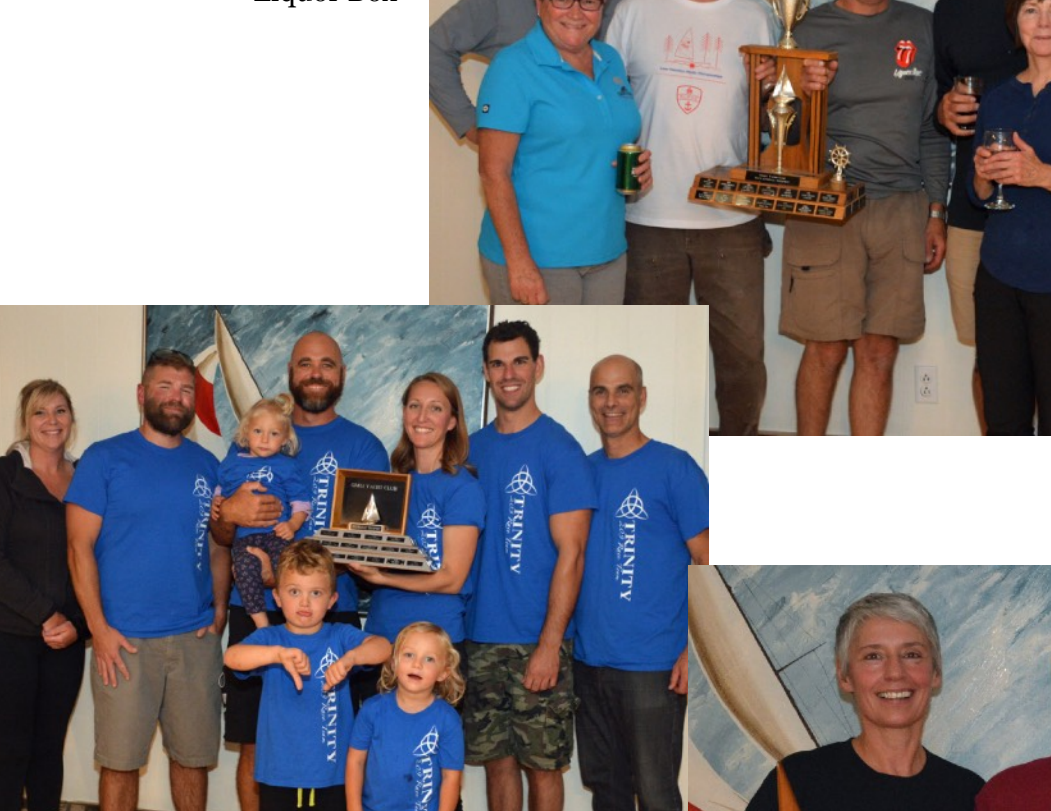
Right: Division 1 champions Liquor Box

Thirteen boats competed in 12 races with 6 boats in Division 1, 5 boats in Division 2 and 2 boats in Division 3. The winds of Lake Winnipeg mostly cooperated throughout the summer. Competition was very close with top 3 finishers for each series decided on last race day. Check out GYC Facebook page for more information If you are interested in learning how to race, race by joining a crew contact Gimli Yacht Club directly, through the GYC Facebook page. Many thanks to Mike Guezen and everyone who assisted with running the 2019 WNR.